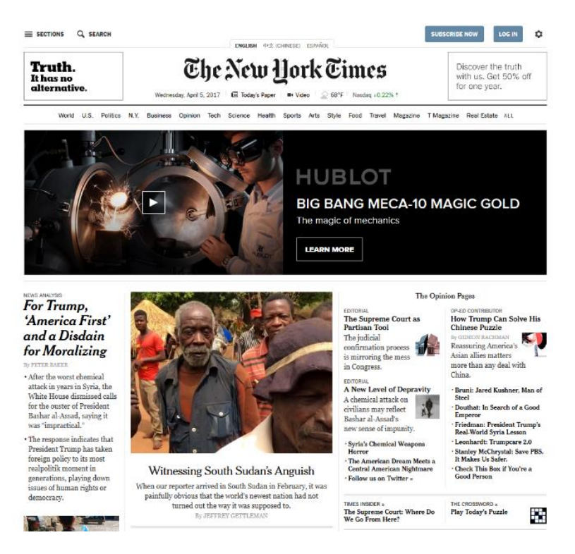
Figure 3: The New York Times website

The online version of a newspaper poses no problems to human users, and, since it is open digital text, one might expect it to be a perfect source for TDM. Indeed, newspapers are a valuable source for TDM, but they are far from perfect. The front page of The New York Times ,<sup>20</sup> for example, needs extensive cleansing before it is usable for TDM purposes: header, footer, banners, login buttons and similar items would have to be removed before passing the pages on to TDM processes. This can certainly be done and dedicated software that removes the so-called boilerplate material is extensively used. However, the original version is not directly useful to TDM processes, and this again requires extra time and work on the part of the TDM practitioner.