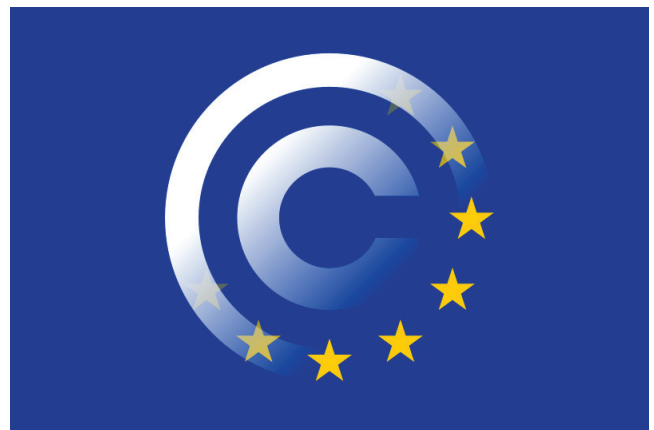
Hybrid between Wikipedia copyright symbol (public domain) and EU flag (ineligible for copyright)

Self-regulation and guidelines can be useful in sectors that deal with personal data, for example, by clearly describing how miners can comply with data protection rules.